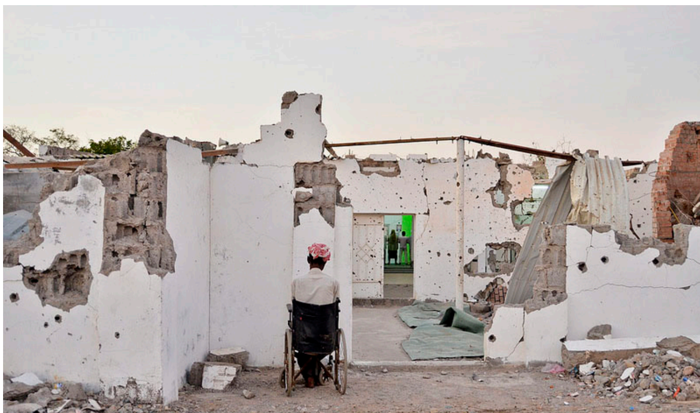
This man in a wheelchair recently returned to Al Kawd. He says his prayers in a badly damaged mosque.